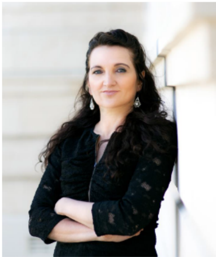
Myself, before EHS.