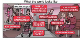
Tavistockian refreezing and brainwashing in action

This is also called the Gestalt Method. It tries to steamroller over structuralist psychology, which is more about introspection, self-awareness, one's actual identity, objective truths and drawing on time-tested traditions. The Tavistock and Levin methods are about "unfreezing" or dismantling that existing "mind set." Defense mechanisms (aka traditional thoughts) have to be bypassed and washed away. It is replaced with moral relativism . Once the subject is suitably confused, there is a transition or refreezing.