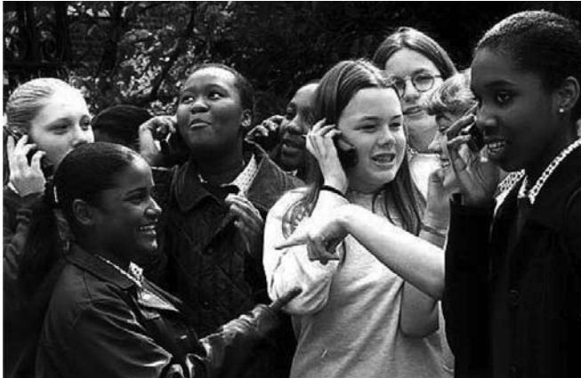
A file picture of British school children making calls on their mobile phones as they leave Grey Coat School in central London

It is a widely held belief that radiation from mobile phones and mobile masts are a health risk.